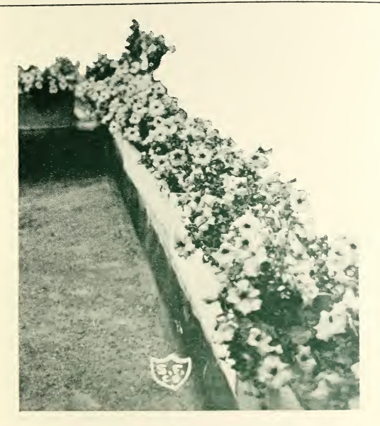
Some Showy Window Box Plants

Growing fine plants for window box filling is one of our specialties and the best and choicest things known are to be had although we do not list all the items we are growing, for brevity's sake.